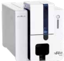
Evolis Edikio Flex

The middle model of the range prints - also on one side - both cards in normal ISO format and cards up to 150mm long for your display or counter. Perfect if you want to be flexible in the size of the signage. Product information is managed via product lists.